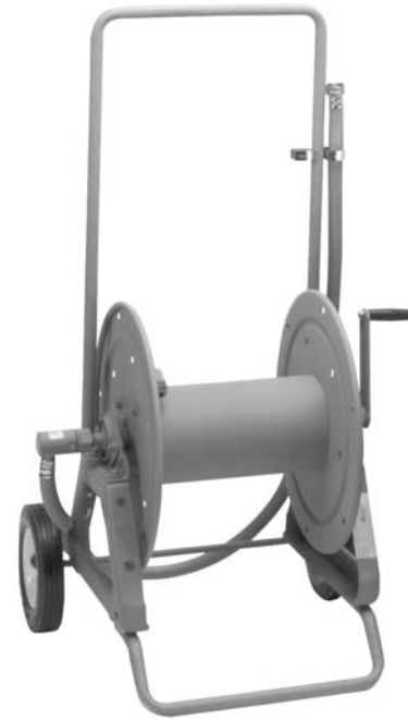
GH 1100 Configuration Shown