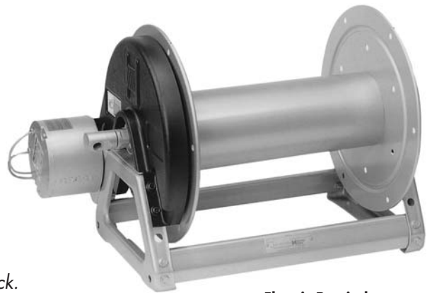
Electric Rewind Standard Configuration Shown