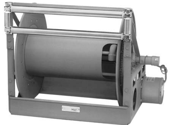
Shown with optional Assembly C Roller

Ring and pinion shaft rewind unit with removable crank handle