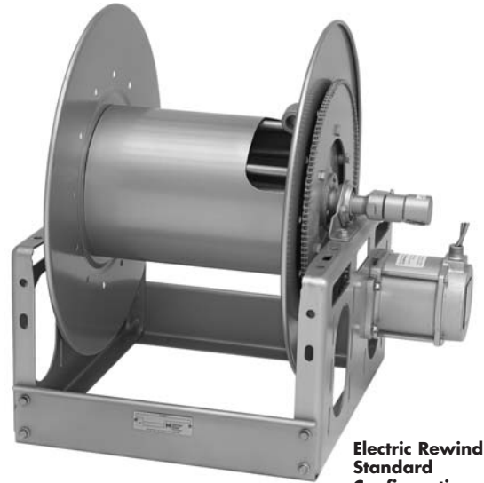
Electric Rewind Standard Configuration Shown