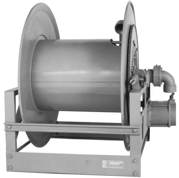
Shown with Optional Auxiliary Rewind