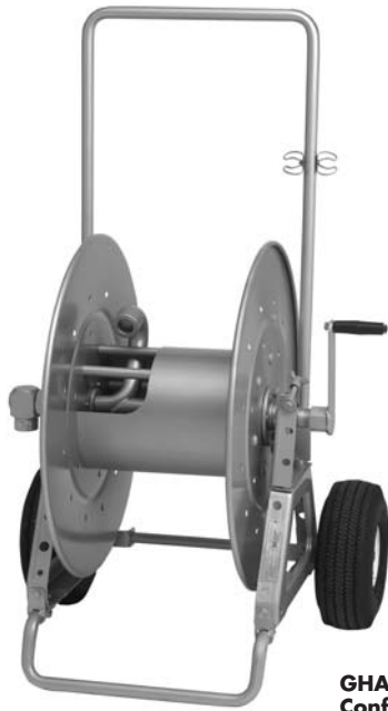
GHAT 1200 Configuration Shown