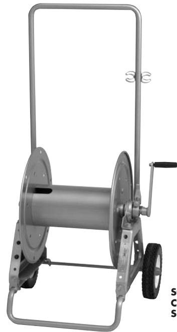
Standard Configuration Shown