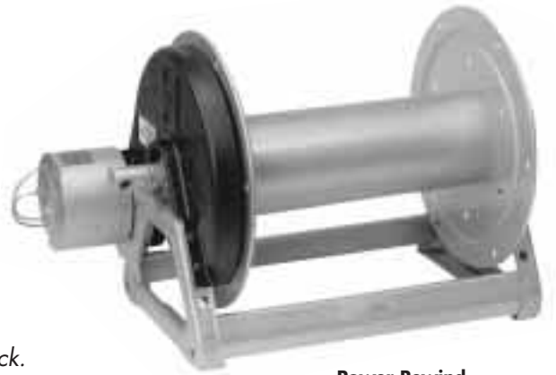
Power Rewind Standard Configuration Shown