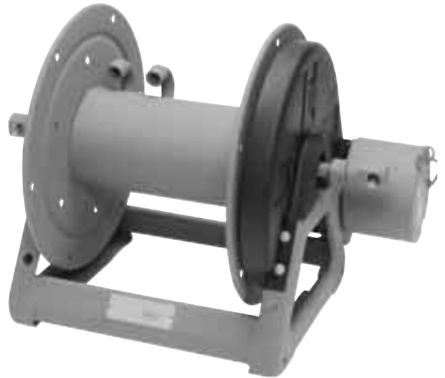
Standard Configuration Shown

See Series 2400 Hannay Reels Welding Catalog H9422-W.