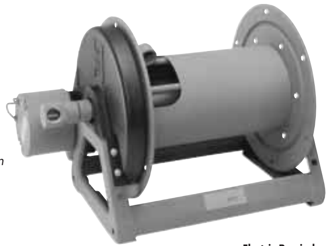
Electric Rewind Standard Configuration Shown