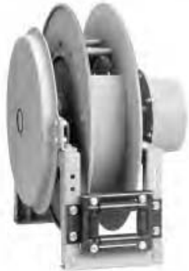
Series SCR700 Standard Configuration shown