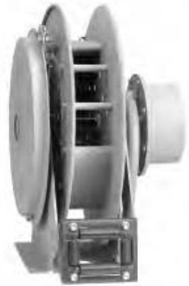
Series NSCR700 Standard Configuration shown